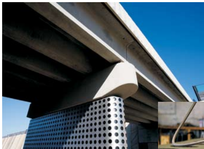
Right: New Touch Laser in Bayswater, VIC, laser-cut every sheet for the bridges' external cladding according to the designers' plan.

"Reducing the original material thickness from 3mm to 1.2mm was an enormous advantage," says Gordon Heald,